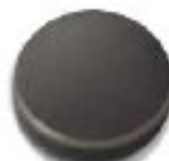
Oil Rubbed Bronze